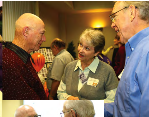
Homecoming 2009: 50-Year Luncheon, McClelland Dining Facility