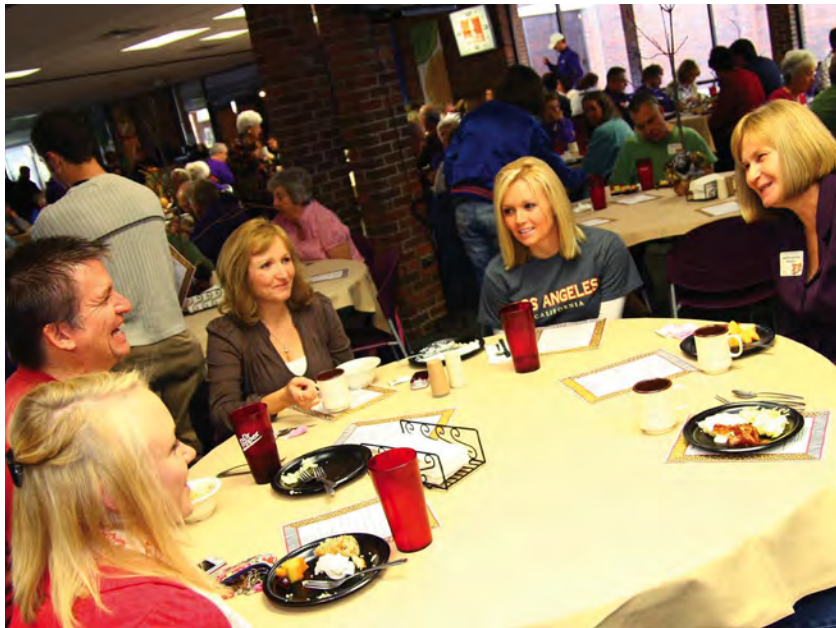
Homecoming 2009: Alumni Breakfast, Mellers Dining Commons