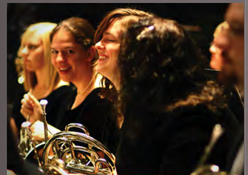
Students enjoying a break from dress rehearsal for Festival of Christmas 2009.

Mission Statement: The Geneva Casebolt College of Music, Arts and Letters creates a Christian atmosphere in which students learn to integrate communication skills, creativity, appreciation of the arts, and an understanding of cultural heritage.