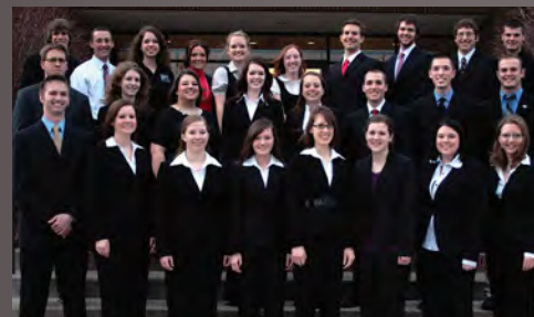
The SBU Students in Free Enterprise (SIFE) team won its 25th first-place regional championship in 26 years at the 2009 SIFE regional competition in Denver, Colo.

Mission Statement: Provides educational programs in business and computer information sciences that integrate theories, concepts and experiential applications with a Christian worldview.