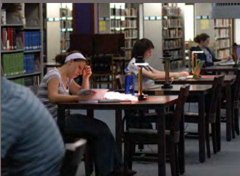
Students studying in the Harriett K. Hutchens Library on the Bolivar Campus.

Mission Statement: The University Libraries provide access to and instruction in the use of information resources and services that support the academic programs and the University community.