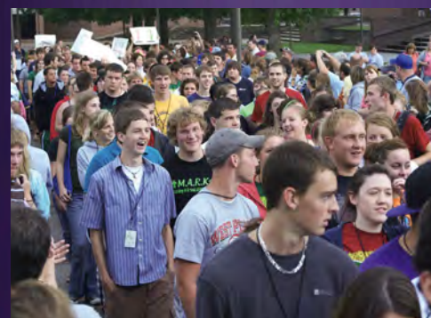
Welcome Week 2009: 460 new freshmen enjoy the festivities during their first week on the Bolivar Campus.

Percentage of full-time faculty with a doctorate or other terminal degree 63%