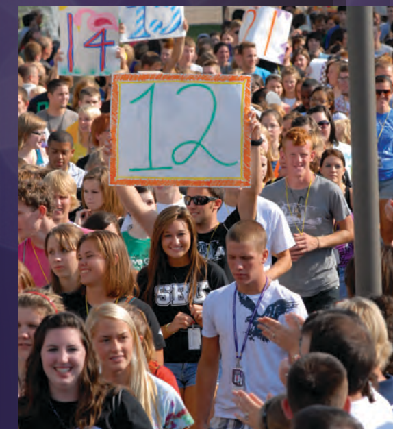
Welcome Week 2010: New freshmen enjoy the festivities during their first week on the Bolivar Campus.